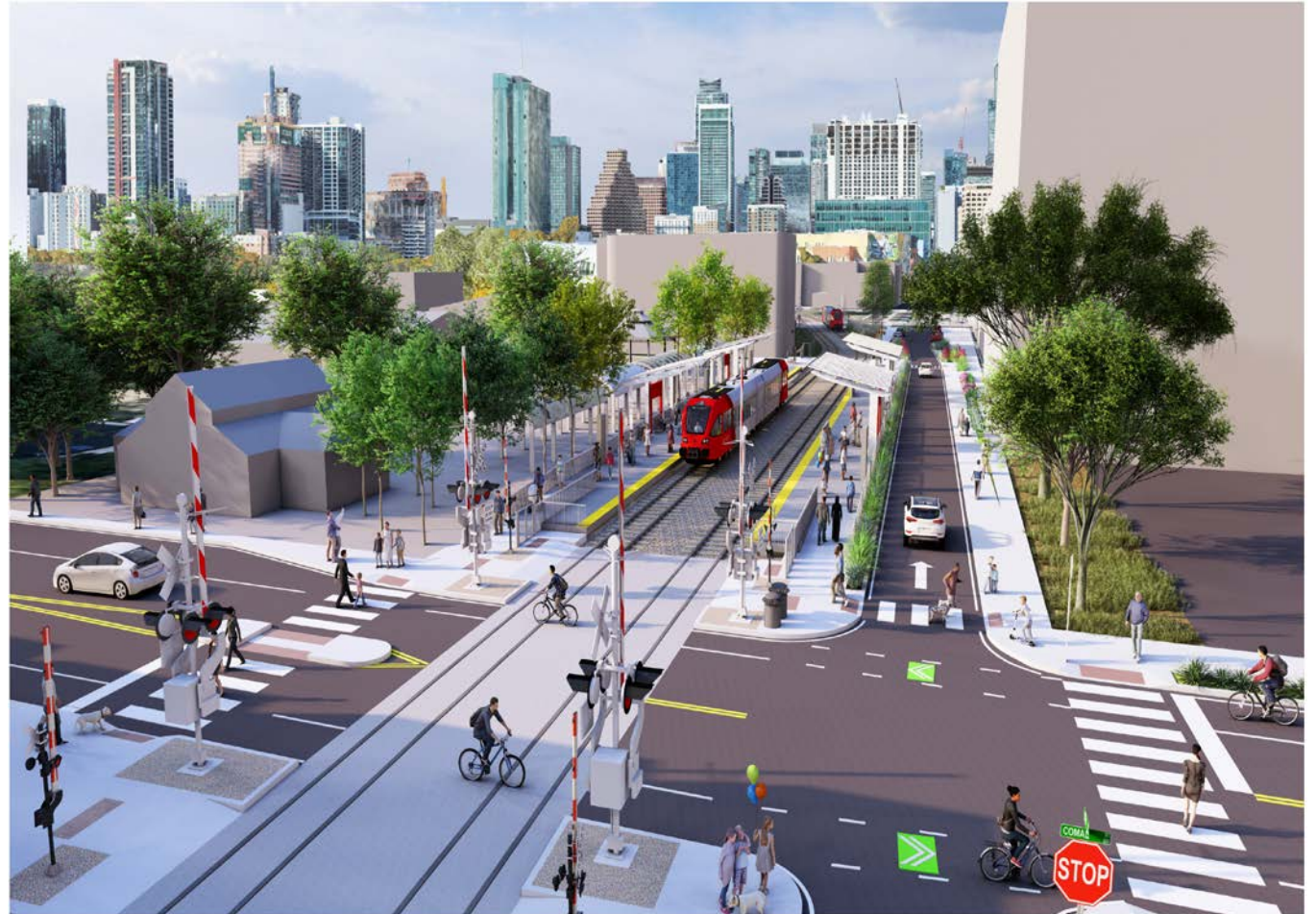
VIEW LOOKING WEST ONTO PLAZA SALTILLO STATION